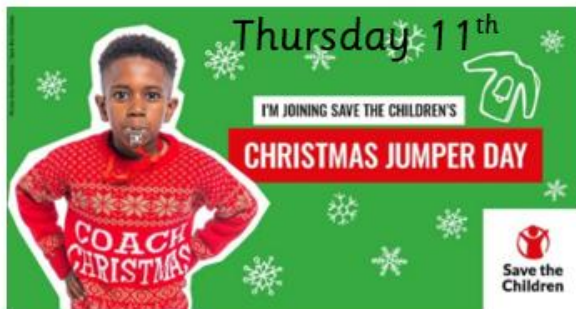
Christmas on top- school uniform bottom